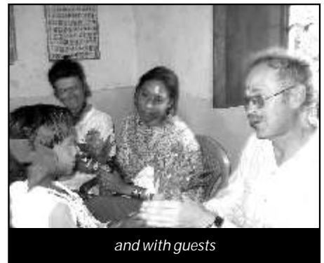
and with guests