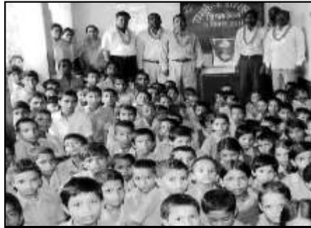
Teachers Day Celebration in Rugmark School