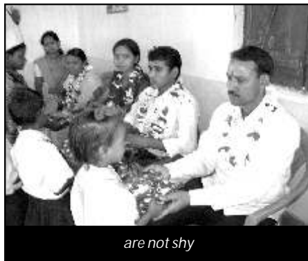
are not shy