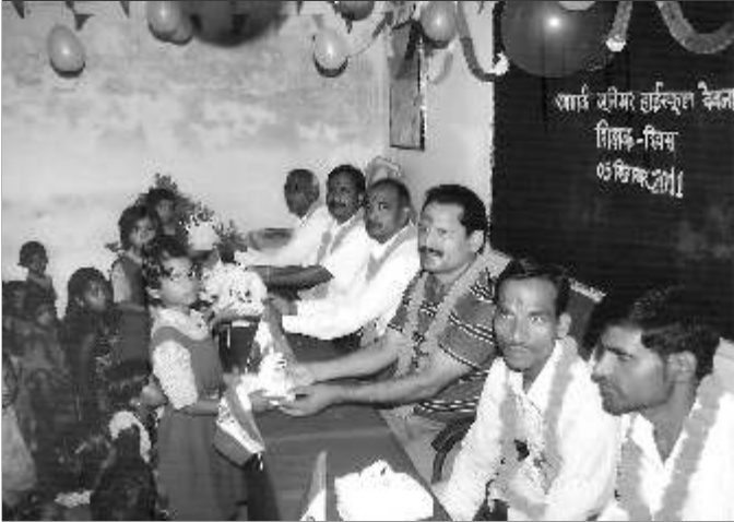
A good teacher is like a candle - it consumes itself to light the way for others.

primary and junior sections performed various programmes with many songs and dances in a festive mood.