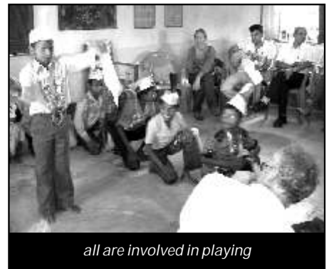
all are involved in playing