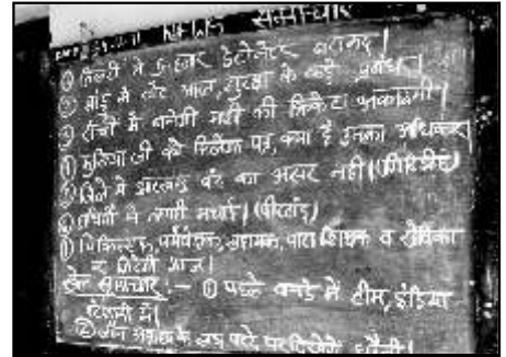
Notice Board of The Little Keb School