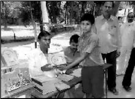
Note Book Distribution in Rugmark School