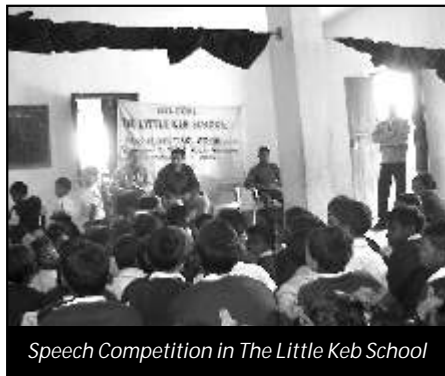
Speech Competition in The Little Keb School