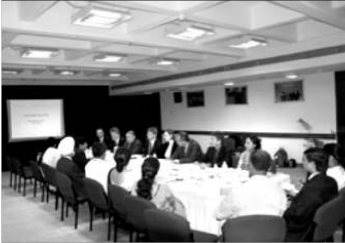
Meeting of the delegation with representatives of the Confederation of Indian Industry.