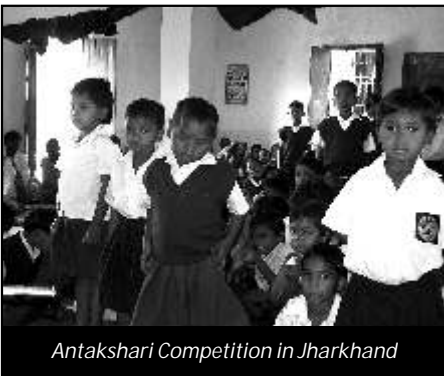
Antakshari Competition in Jharkhand