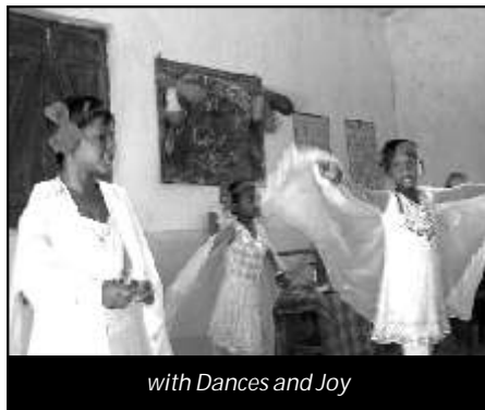
with Dances and Joy