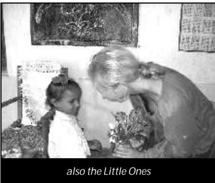
also the Little Ones