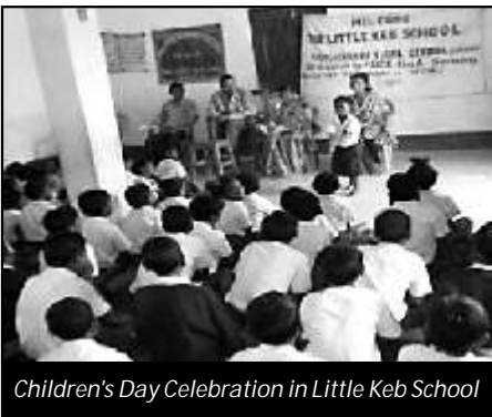
Children's Day Celebration in Little Keb School