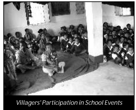
Villagers' Participation in School Events