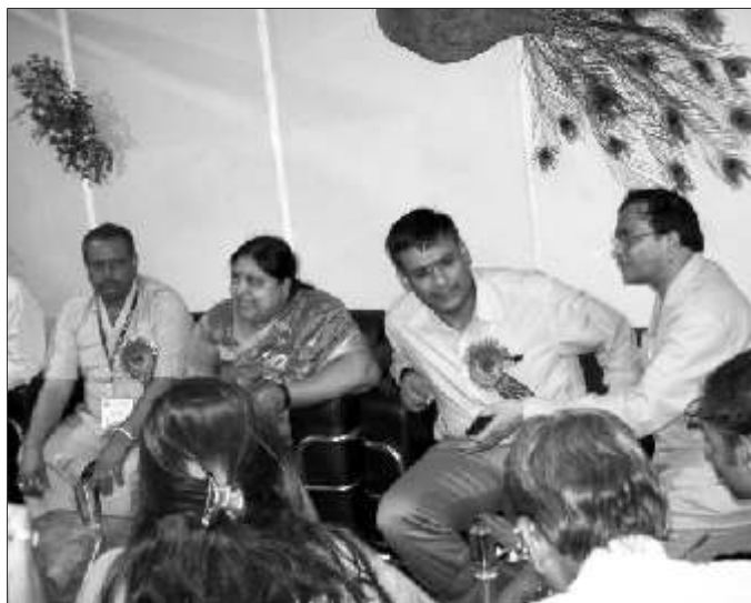
Smt. Panabaaka Lakshmi, Minister of State for Textiles, Ministry of Textiles, Government of India at the Carpet Expo in Varanasi.

She said that the India Carpet Expo has established itself as sourcing platform for buyers from all over the world and generates new business opportunities for